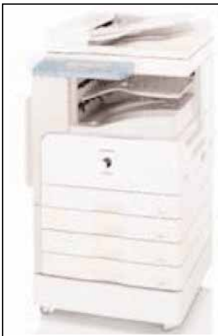
● Canon iR2020

Canon has launched a compact, intelligent multi-functional communication device that can copy, print and fax -