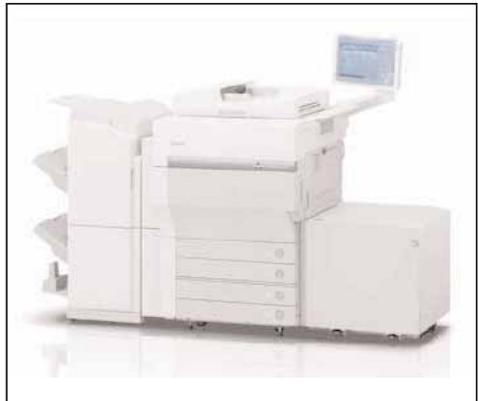
● The awesome Canon imagePRESS C1

New V-Toner, E-Drum and T-Developer offer outstanding image quality and stability day after day while an oil-less fusing system provides the look and feel of an offset print.