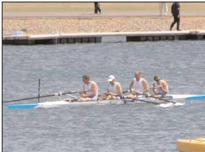
● Back together five years on

Sir Steve, Sir Matthew Pinsent, Tim Foster and James Cracknell could only manage a third placed finish this time round, as they trailed narrowly behind the Slovenians and the Italians - but more importantly, more than £35,000 was raised. This time Sir Steve was raising money for the World Food Programme rather than causes in the UK as the world focus has been on the victims of the Tsunami disaster this year.