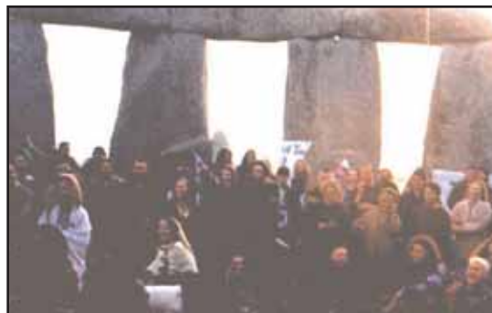
● Stonehenge on Summer Solstice

and light bonfires during the night. When the sun rises, chants and prayers are performed.