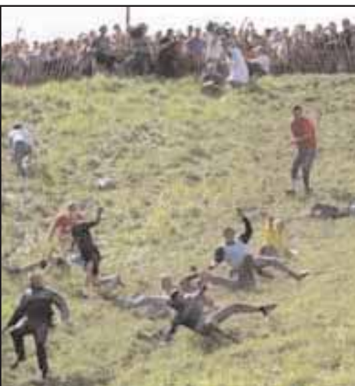
● Are you a face in the crowd?

The event has proved so dangerous in recent years that the police have occasionally resorted to banning it. Those there to witness this audacious act - a bunch of fully-grown men chasing a seven pound cheese down a hill - will realise that a police ban does nothing in the way of deterring them.