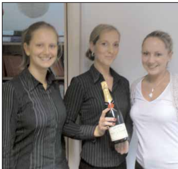
● The girls from SIS Ltd

SIS Direct sells possessions insurance for students through the Internet. It has many years experience of the student market, and student possessions insurance in particular. SIS has learnt its trade with one of the best known names in student insurance, so you can be sure it knows what its talking about!