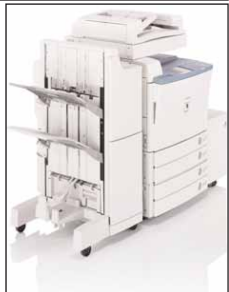
● Canon IRC 3220