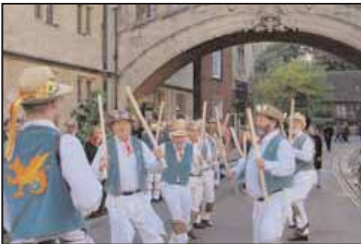
●C&G Business Equipment staff in action