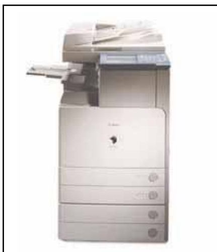
● Canon iR 3100C