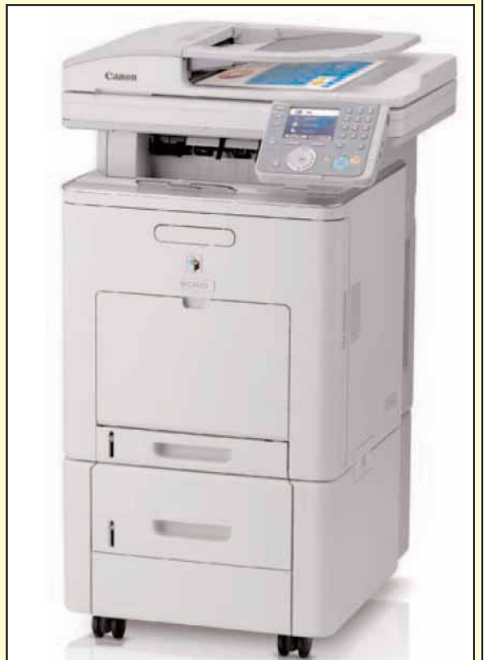
● The new Canon iRC1021i

which allows you to monitor and account print jobs and Secure Printing, which holds print jobs until the user correctly identifies themselves at the device via the relevant security method e.g. card or password.